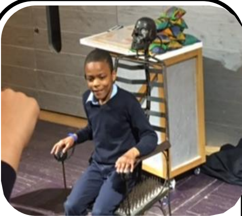
The Nail test