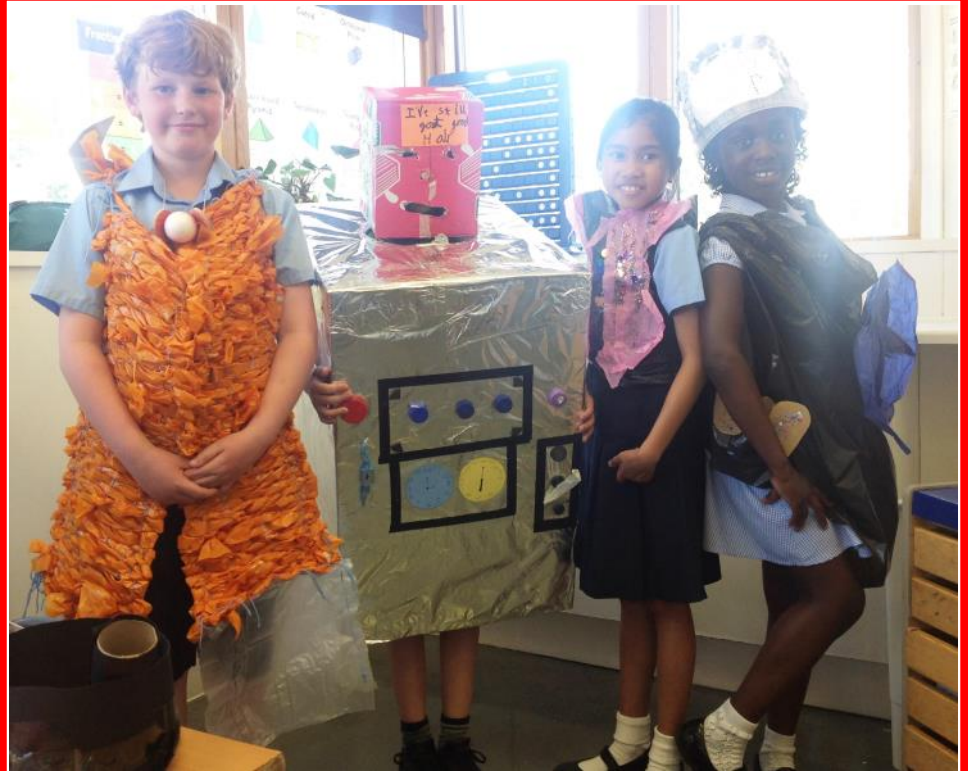
Y4 Recycled Fashion Show Can you guess who the robot is?